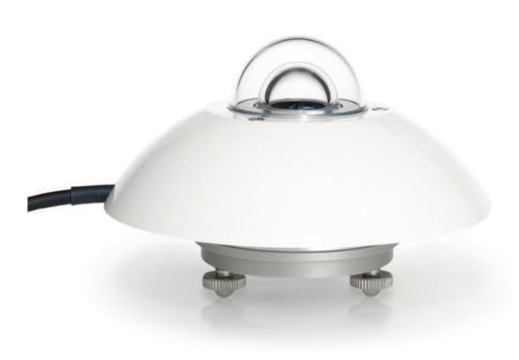
Figure 1 GEO-SR11 first class pyranometer